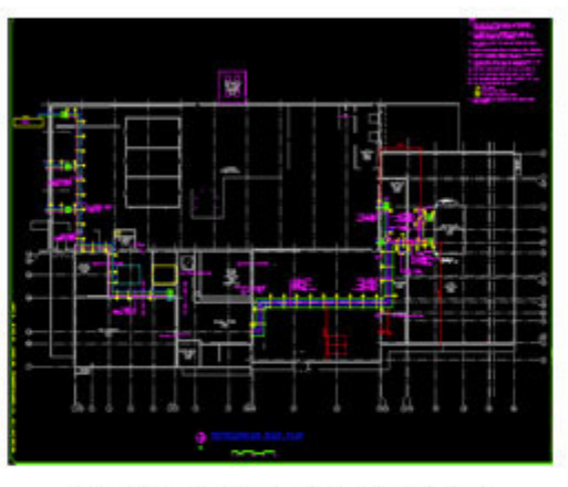
ROOF / FLOOR PLANS